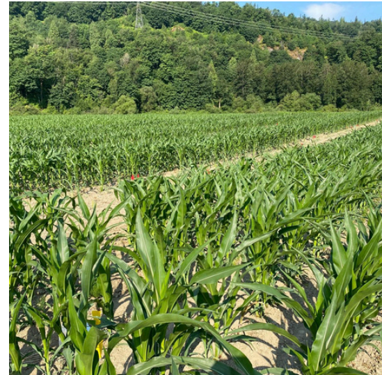
Figure 1. Silage corn in between the 3-leaf and 6-leaf stage in Chilliwack, BC.