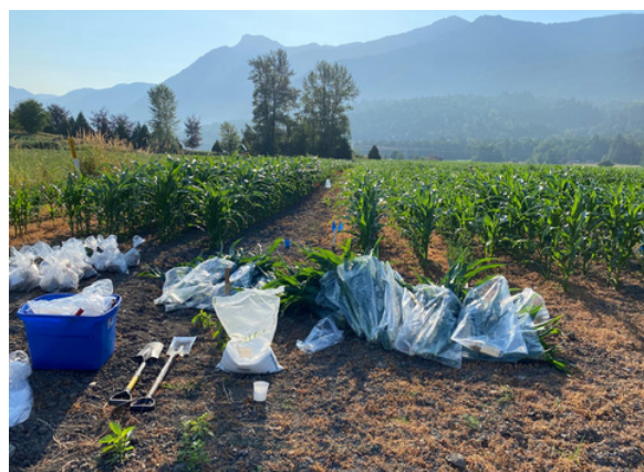
Figure 2. Harvesting silage corn at the V6 stage.

In BC's Fraser Valley, silage corn is typically managed by applying dairy manure at a rate that provides 50 kg P/ha at the beginning of the growing season (at plowing) plus 40 kg P/ha of mineral starter P fertilizer at the time of corn seeding. The mineral P fertilizer applied at seeding is called starter fertilizer and is intended to increase the amount of P available for early plant growth. Because agricultural soils in this area are already high in P and manure is added every year (supplying more P) we wanted to see if mineral starter P fertilizer application rates could be reduced without negatively affecting yield or early plant growth.