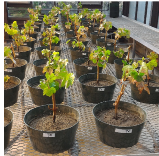
Figure 1. Merlot cuttings growing in soil mixed with milled cover crops.