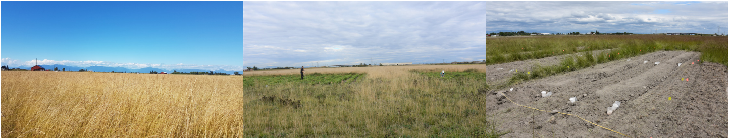
L to R: Grassland Set-aside; UBC students sampling in GLSA field; Various fertilizer treatments for controlled field experiment